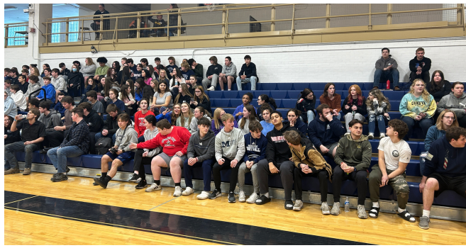
The junior high and high school students at the pep rally