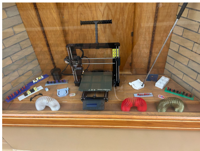
Some of the student 3D printing creations are located by the office and include giant Lego blocks and golf putters

For students who may not be interested in technology, Intro to Ceramics might be a good fit. Students who love to create things through art may find ceramics fun and rewarding.