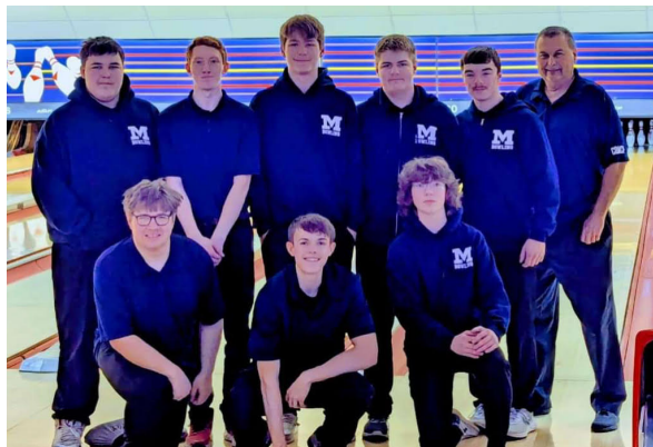
The boy's bowling team after hearing they qualified for state

3D printing is becoming more and more prevalent and popular in more than just the workforce. Students interested in using 3D printing as an elective can expect to learn design skills to create 3D printed objects and apply the design topics to everyday items.