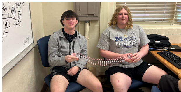
3D Printing students playing with their 3D printed slinky